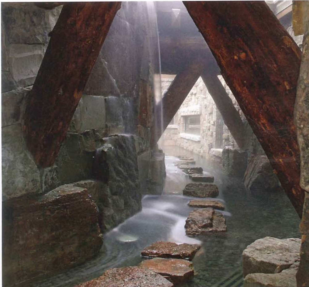
This massive moss rock streamway by Judge + Associates leads to a subterranean wine cellar.