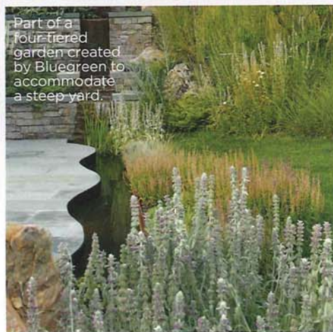
Part of a four-tiered garden created by Bluegreen to accommodate a steep yard.